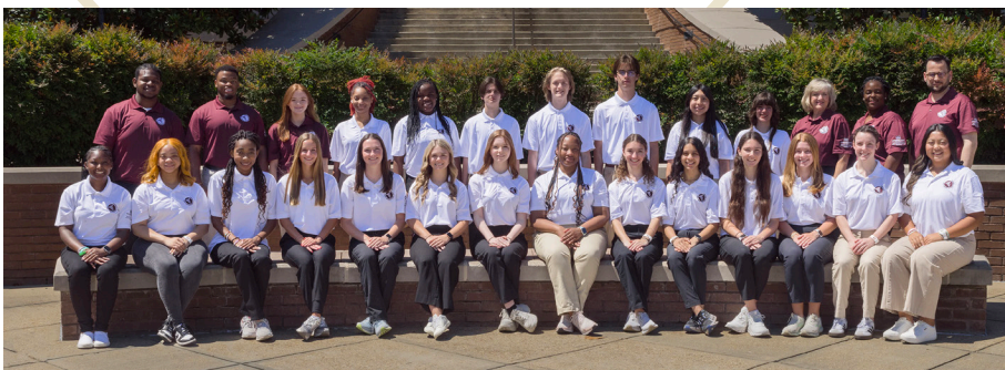
2024 Rural Medical & Science Scholars

We gratefully acknowledge the Mississippi State University Extension Service, the MSU College of Agriculture and Life Sciences, the Office of the Provost and Executive Vice President, the Office of Rural Health and Primary Care, CREATE/Toyota Wellspring, and CareSource for their support of this program.