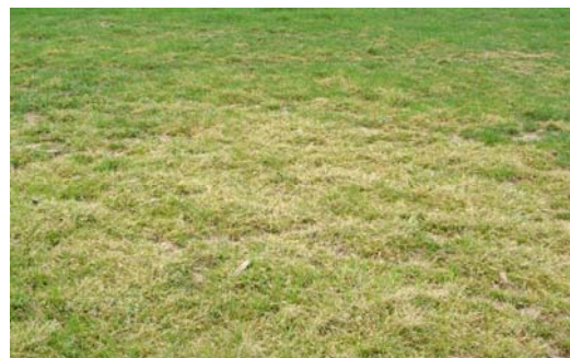
Figure 1. Winter weeds, like annual bluegrass, can hamper wheat growth and reduce yield, if allowed to grow until spring.

Fall Weed Control in Wheat – Many winter weed species, including wild garlic, henbit, annual bluegrass, and ryegrass, and summer species are emerging, particularly in early-planted wheat fields. Do not be reluctant to control these weeds now, if they are thick, because heavy competition will rob nutrients and reduce wheat tillering. Thus, fewer wheat heads will be produced next spring. I believe late herbicide timing is one of the key management areas where we often leave a lot of wheat yield potential on the table. Uninhibited weed competition for the next 90 or more days, particularly in the South, where winter dormancy is slight and not lengthy, will reduce wheat yield potential. Dicamba and 2,4-D should not be applied postemergence to wheat in the fall, because wheat is intolerant during seedling and tillering stages.