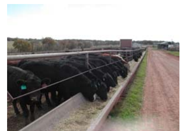
Farm to Feedlot provides an opportunity to gather postweaning performance information