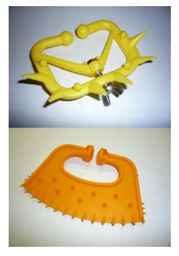
Several styles of weaning nose-clips are commercially available.

"...Decreasing stress at weaning can help prevent illness in calves."