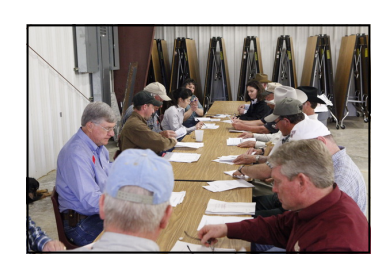
The Mississippi BCIA Board of Directors met recently following the spring bull sale to conduct the Association's business