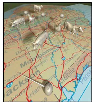
Every $1 million of beef cattle product output in Mississippi is responsible for over 17 additional jobs