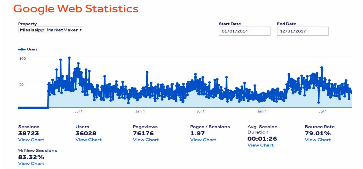
Fig 4. Google Web Analytics of Mississippi MarketMaker from May 2014 to present.

There are 37 fishing businesses, seafood and fish markets registered in MarketMaker which harvest, process, and sell striped mullet. Click this LINK to view the search results online. Since May 2014, more than 36,000 web users visited the Mississippi MarketMaker website (Fig. 4). These web users visited more than 76,000 webpages and stayed about 86 seconds per visit.