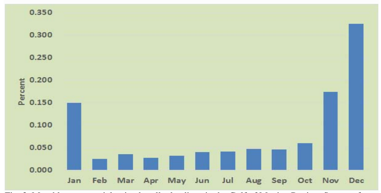
Fig. 3. Monthly commercial striped mullet landings in the Gulf of Mexico Region. Source of raw data: NOAA Fisheries (<a href="http://www.st.nmfs.noaa.gov/">http://www.st.nmfs.noaa.gov/</a>).

In 2015, the Gulf-wide landings of commercial striped mullet fishing reached about 10.6 million pounds. The fish species was caught year-round with almost two-thirds of the landings reported from November to January (Fig. 3).