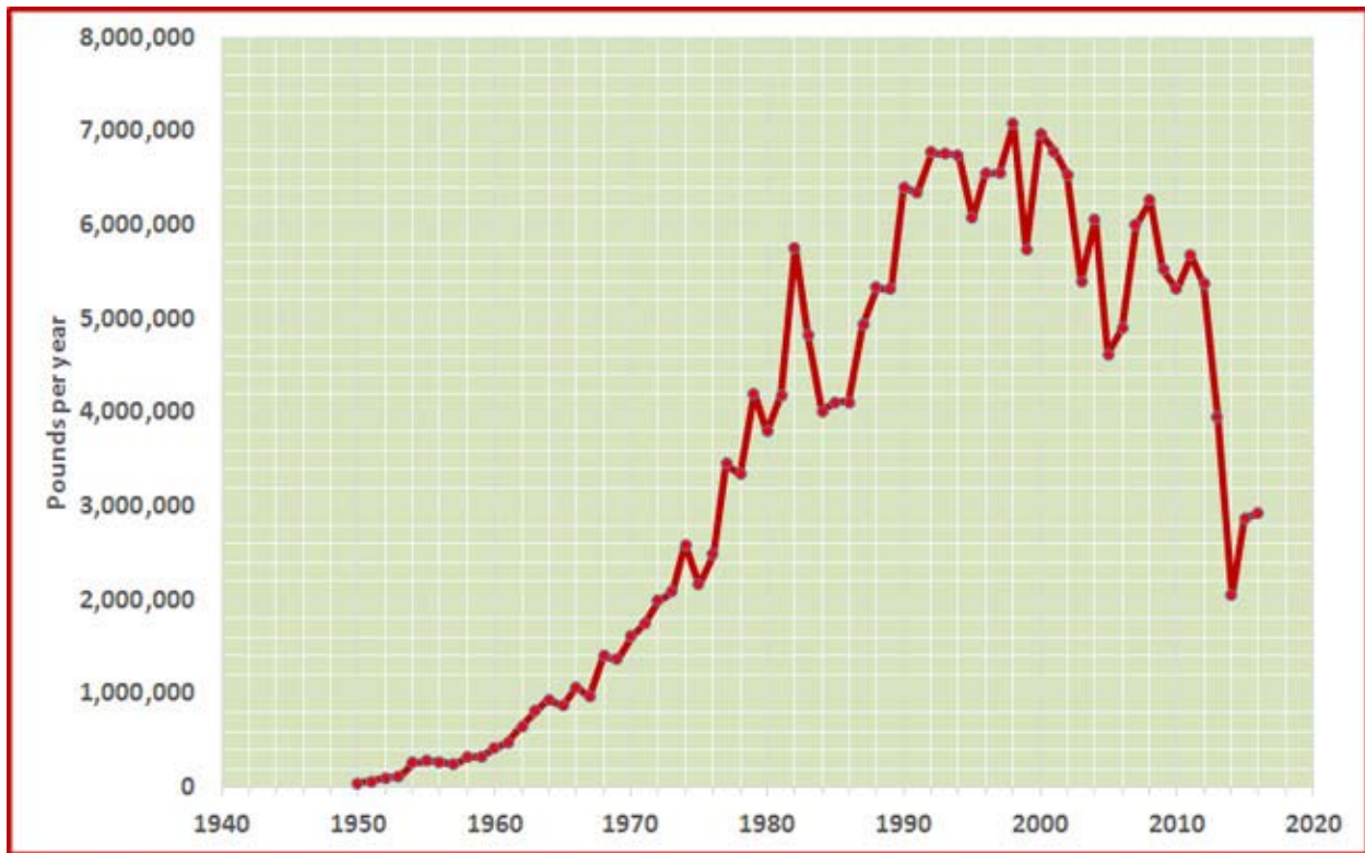
Figure 4. Annual commercial Florida stone crab claw landings in the Gulf of Mexico states. Source of raw data: NOAA Fisheries. Last visited: June 26, 2018. http://www.st.nmfs.noaa.gov/ .