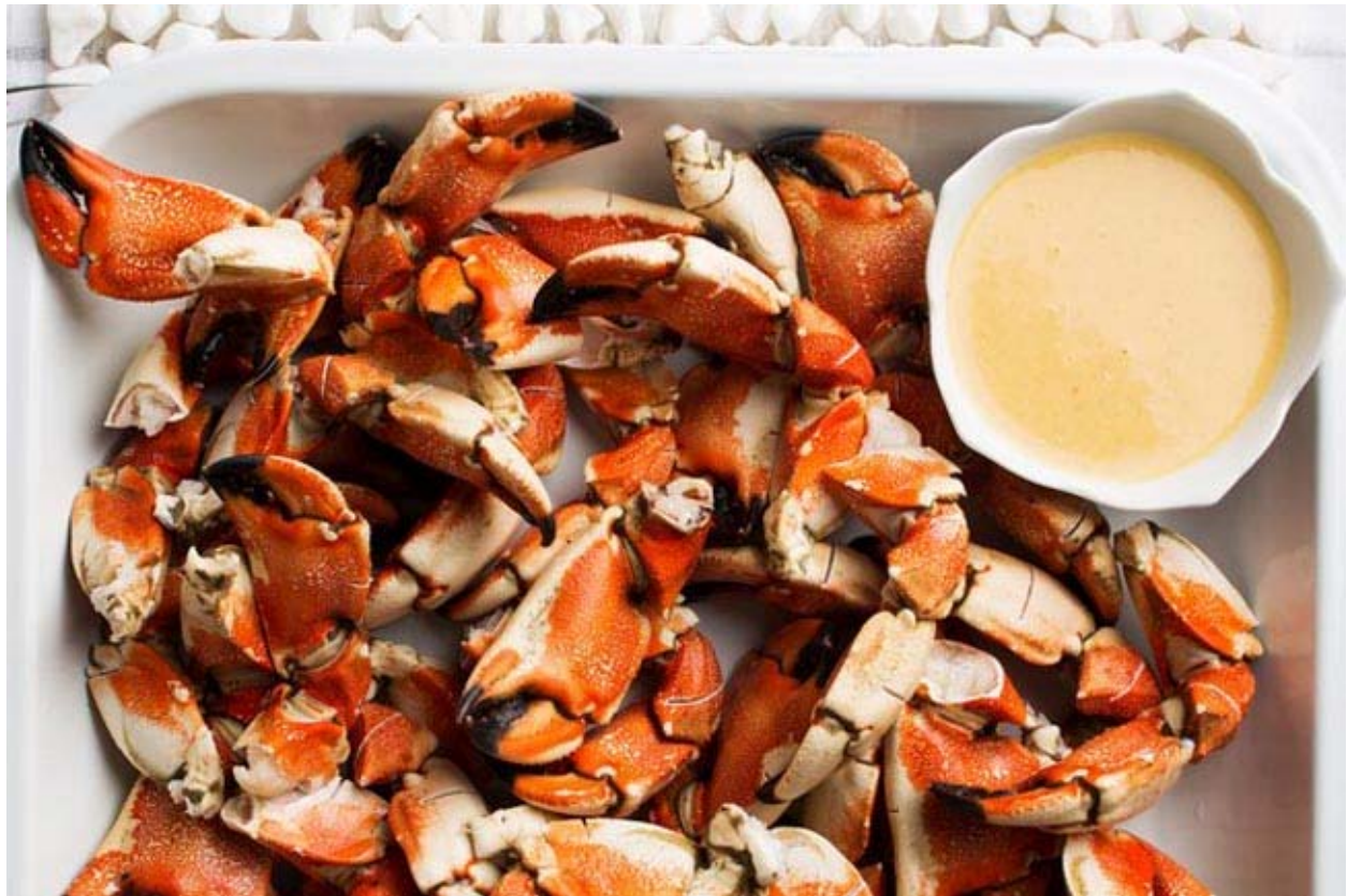
Figure 3. This recipe is courtesy of https://www.epicurious.com/ . For ingredients and cooking instructions, please visit https://www.epicurious.com/recipes/food/views/stone-crab-with-mustard-sauce-51126840 .