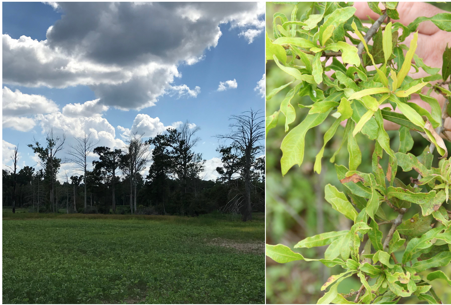
Severe damage resulting from paraquat and dicamba drift that resulted in widespread tree mortality along field edge.

Unlike drift damage to agricultural commodities (drops in yield), herbicide damage to hardwood trees is much harder to evaluate and quantify. Often the idea is that if a tree is damaged and lives, it will survive, continue to grow, and successfully fulfill whatever its end purpose is. While that is not necessarily untrue, ultimate damage to a tree depends various factors. Consideration should be given not only to damage severity, but also to its frequency. Even low-level herbicide exposure can have a large cumulative impact to tree vigor and wood quality if repeated over time. One only needs to observe the prevalence of low-growing forks often encountered in hardwood plantations damaged through multiple drift incidences. If timber production is a goal, stands with a high frequency of forking are unlikely to ever reach commercial timber status. In addition, lowering of vigor increases a tree's susceptibility to other mortality causes including insects and various pathogens. While we do not have enough time to list all considerations, please contact your local MSU Extension agent, or Forestry Specialist with any questions you may have.