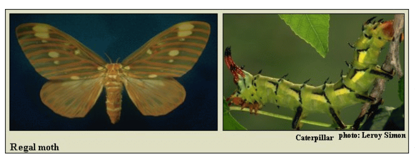
its range. Adults do not feed.

Females lay rows of 2-6 eggs on both sides of leaves of box elder, sugar maple, wild cherry, plum apples, alder, birch, dogwoods and willows. Eggs hatch in 10-14 days. Young caterpillars feed in groups on leaves older caterpillars are solitary. The cocoon is attached along its full length to a twig. It is usually constructed in a dark, protected area. One generation from March-July in most of