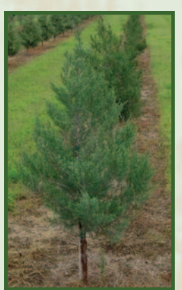
Figure 3. Three-year-old Eastern redcedar, Rosebud Christmas Tree Plantation