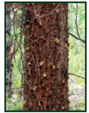
Example of Pitch Tubes, (Photo: Brady Self)