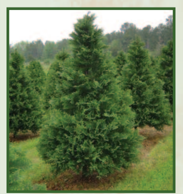
Figure 1. Leyland cypress, Rosebud Christmas Tree Plantation in Walnut Grove