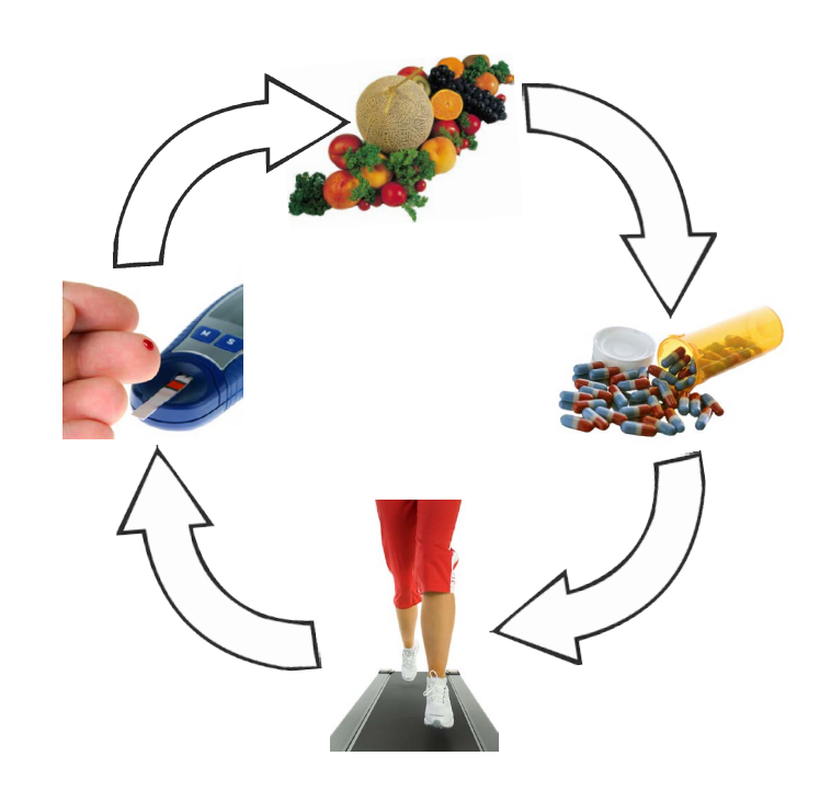
Figure 1. The four elements of diabetes control: a prescribed meal plan, regular physical activity, medications, and monitoring blood glucose.

There is no known cure for diabetes, but lifelong treatment can help control the disease. Treatment also reduces the likelihood of long-term problems from this disease and increases the chances for a long, healthy life.