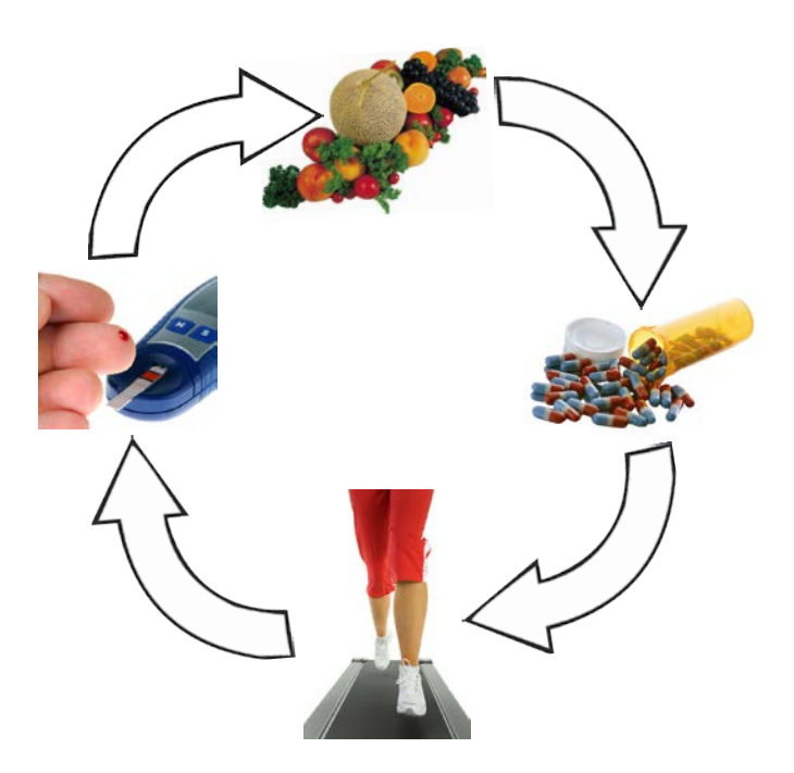
The four elements of diabetes control: a prescribed meal plan, regular physical activity, medications, and monitoring blood glucose.

Impaired fasting glucose is a new diagnostic category in which people have blood glucose values greater than normal but less than the diagnosis level for diabetes. Impaired fasting glucose may be a sign of higher risk for developing diabetes.