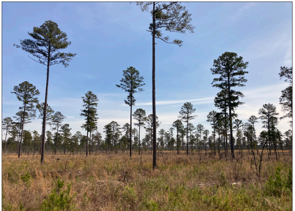
Figure 2. Seed-tree harvest.

Most light-seeded hardwoods are not desirable for timber management, but this method could be used for a