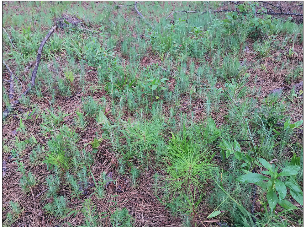
Figure 3. Young pine seedlings in a seed-tree cut.

control undesirable vegetation and prepare a new seedbed (Figure 4). This could happen if your planned regeneration year is extremely droughty or if an unexpected flood washes seeds away from the area. This is not a typical occurrence.