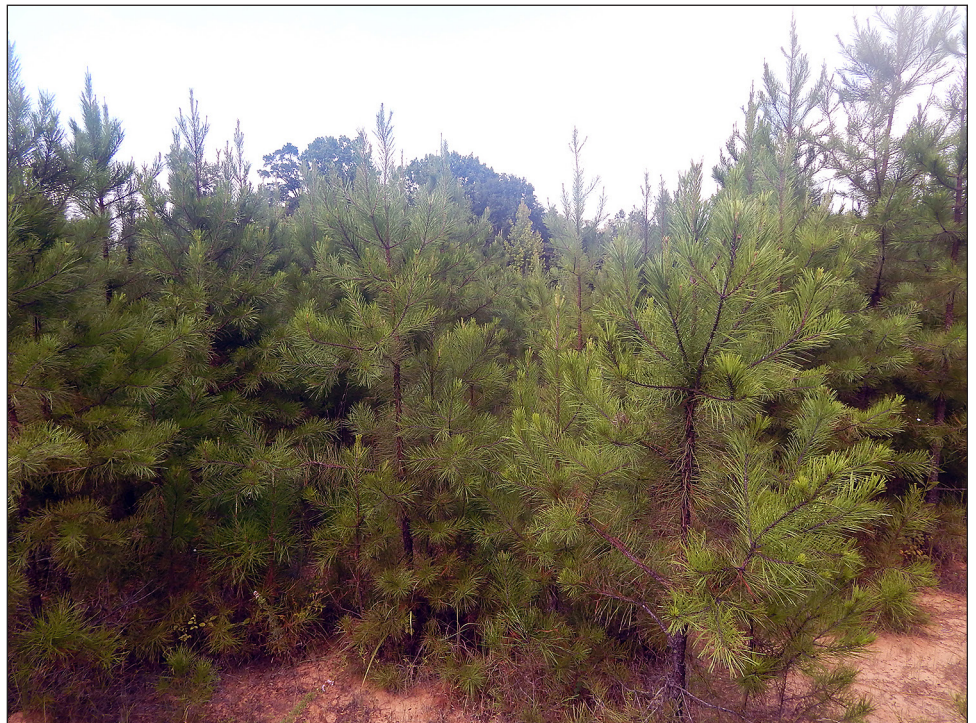
Figure 4. Adequate regeneration in a 3-year-old seed-tree attempt.