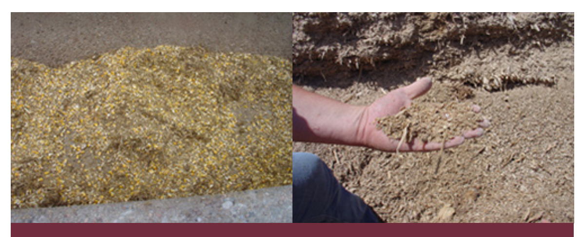
Nutritional program information gathering is essential in selecting a feedlot.

Discuss cost of gain with feedlot management. This will indicate the yard's track record on feeding performance and help compare costs with industry alternatives. Feedlot diets vary, based on local availability and cost of feed ingredients. Ask how often feed is purchased, how feed is processed, how often cattle are fed each day, and how many days on feed can be expected. Cost of gain is a good indication of how well feedlot production and financial management compares to competitors.