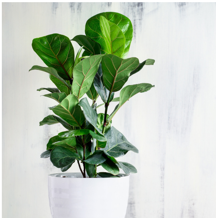
Fiddleleaf figs are popular houseplants that are prone to insect infestations.