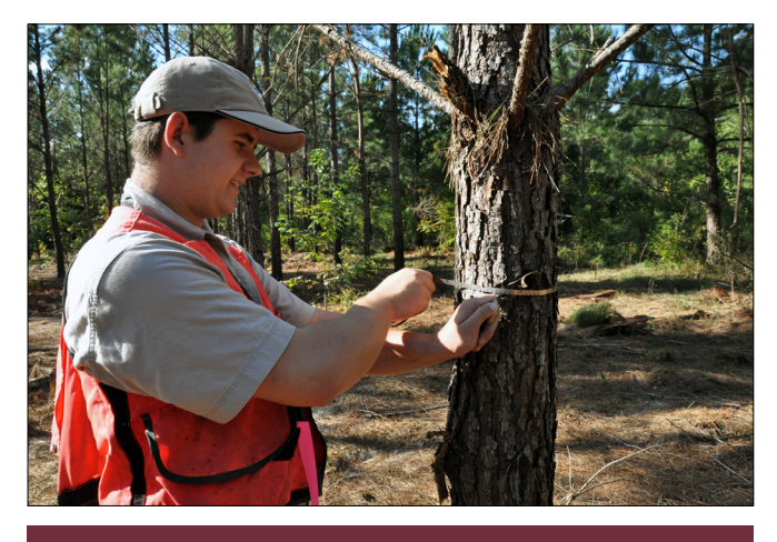
Figure 1. DBH measurement.

read MSU Extension <u>Publication 1473 4-H Project No. 7:</u> <u>Measuring Standing Sawtimber</u>.