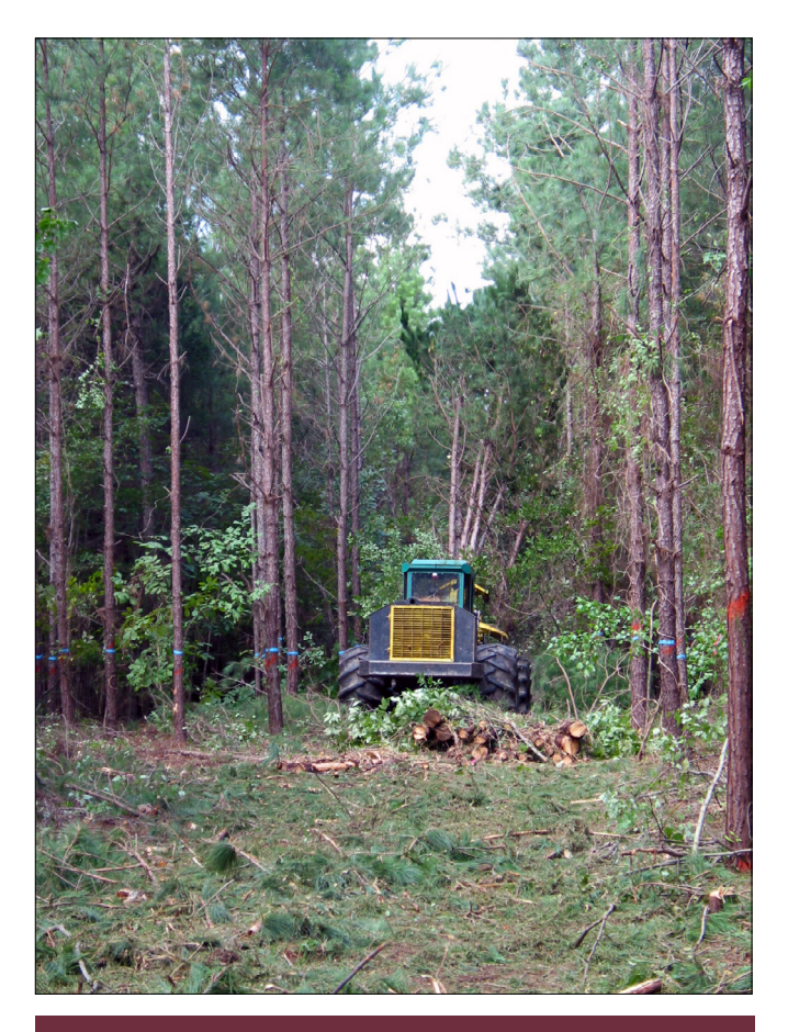
Figure 5. Unmarked trees being removed.

You may find it helpful to use two measuring tapes to achieve desired spacing distance. A tape will also help you visualize boundaries of the square. Lay one tape down along your compass line and place the other perpendicular to the first. The crossing point is the center of the square. You can use this method until you have mastered judging the correct distance between square centers and their boundaries. As you gain experience selecting trees and judging proper spacing distance, you will find that you can navigate and mark leave trees very close to the desired spacing, using compass lines and grid squares occasionally as a check.