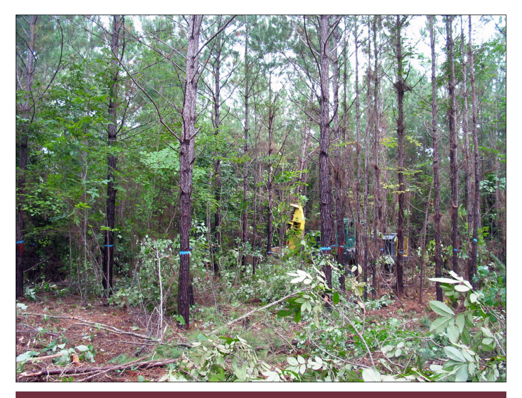
Figure 6. Completed thin.

For more information and publications about leave-tree marking and other thinning techniques, contact your area Extension forestry specialist or Mississippi Forestry Commission area forester. Mississippi State University Extension also has various publications to help you manage your timber. These can be found at <u>extension</u>. <u>msstate.edu</u>, or you can contact your county MSU Extension agent for more information.