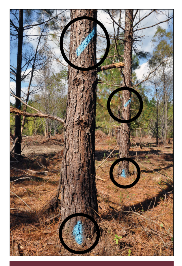
Figure 4. Marked trees.