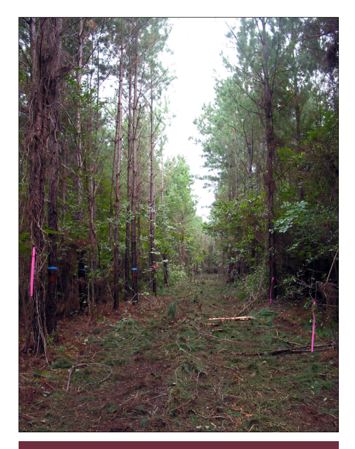
Figure 2. Compass lines marking access corridor.

If you choose to flag your compass lines, make sure that you maintain straight lines by turning around and checking for linear accuracy. Each line will run through the center of a row of imaginary squares. Begin your first compass line half of the spacing distance into the edge of the pine stand (7½ feet in this case). For example, if you begin at the southeast corner of the stand, your first compass line should begin 7½ feet from the south and 7½ feet from the east stand boundaries. This will place you in the center of your first imaginary 15-by-15-foot square. You can use a measuring or logger's tape to help you judge the size of the square.