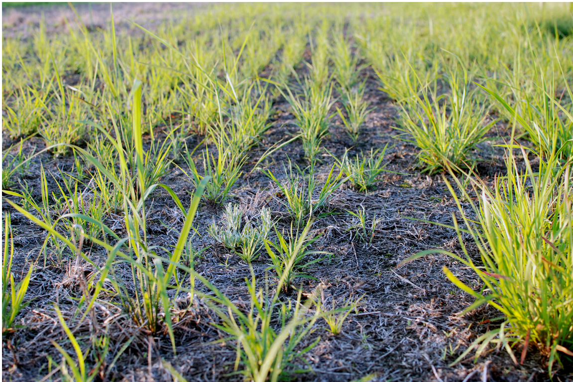
Figure 1. Proper weed control before establishment is essential for stand success. Native grasses are notorious for delayed germination and slow growth. Pre-emergence applications of herbicides can help ensure successful uniform stands of big bluestem, indiangrass, and little bluestem.

As with any forage crop, establishing a good, thick stand is the first way to reduce competition. You can achieve this with proper site preparation and planting methods ( Figure 1 ). Also make sure the stand remains strong and vigorous by constantly managing and improving soil fertility levels.