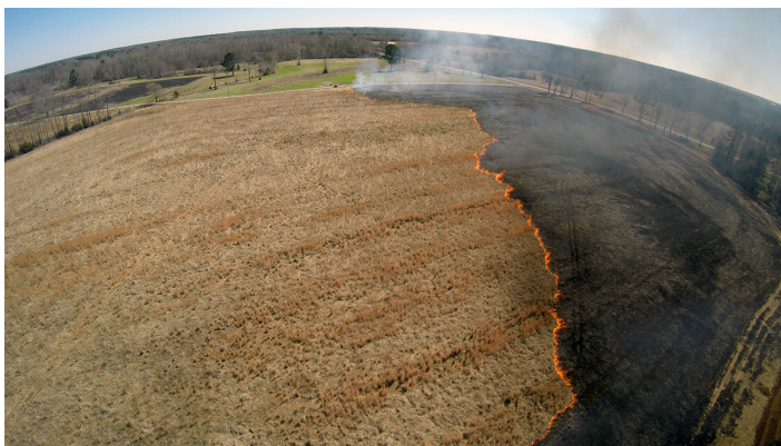
Figure 4. Prescribed burning is an excellent way to control early-successional weeds and brush. The burn pictured above was conducted during the early growing season when vegetation had already begun greening up, yet there was a sufficient amount of the previous year's biomass available as a fuel source.

Prescribed burning is another cultural practice that can effectively control weeds in established NWSG stands (Figure 4). Prescribed fire is neither innately destructive nor constructive but, ultimately, is a source of change for a landscape (Wade, 1989). Controlled application of fire under specified environmental conditions allows the fire to be managed at a desired intensity within a confined area to meet predetermined vegetation management objectives (Harper et al., 2007). Prescribed burning can reduce litter buildup, increase nutrient availability, stimulate new herbaceous growth, and control undesirable vegetation. For weed control of early successional plants (young trees and shrubs), growing season fires are recommended. These fires are more likely to kill the entire tree, including the root system, if it is actively growing. Growing season burns are most often conducted during the spring when leaves are green but there is still some residue from the previous year's growth for fuel. Temperatures exceeding 145°F are required for killing actively growing weeds (Harper et al., 2007; DiTomaso, 2006). These temperatures can easily be reached by conducting burns in the late summer when trees begin to prepare for fall senescence and winter dormancy. Fire intensity for these burns is usually less than early growing season burns (more green foliage and less residue), but expect a considerable increase in smoke production.