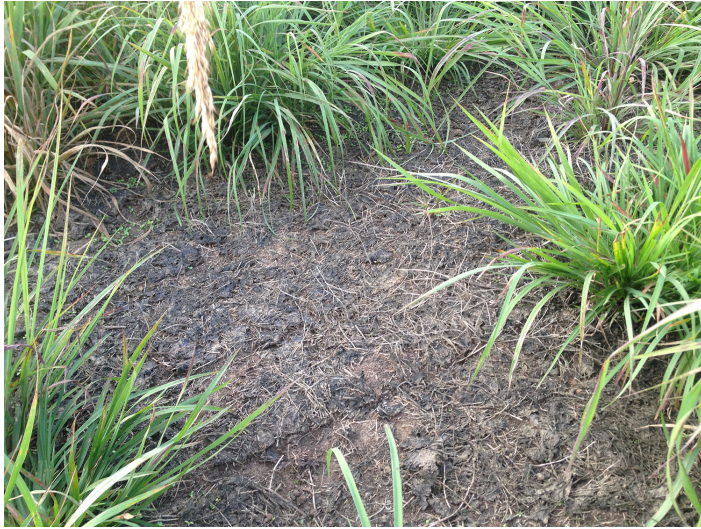
Figure 2. Native warm-season grasses have a bunch-type growth that does not completely cover the soil surface, unlike many traditional forage grasses. This growth creates natural corridors for ground-nesting birds and small mammals to forage and escape from predators. This exposed soil also allows weeds to germinate and mature. Persistent weed control is needed to manage NWSG stands as a forage source that promotes livestock production and wildlife habitat.

Clip stands no lower than 6 to 8 inches to prevent light from reaching the soil surface and encouraging weed seed germination. Native grasses, which grow in a bunch-type habit, are much taller than sod-forming forages (such as bermudagrass) and do not completely cover the soil surface (Figure 2). Close grazing (especially late in the season or during a drought) and excessive clipping will also inhibit regrowth by stressing individual plants.