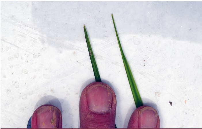
Figure 4. Leaves of purple nutsedge (left) are deep green and come to an abrupt point. Leaves of yellow nutsedge (right) are yellow-green and more tapered.