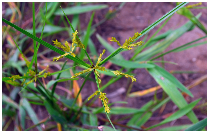
Figure 6. Rice flatsedge in a sweetpotato production field (top); close-up of inflorescence (bottom).