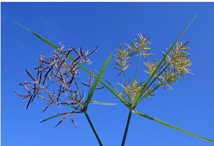
Figure 5. Inflorescences of purple (left) and yellow nutsedge (right).

They are often consumed by wildlife including wild turkeys and wild hogs. Purple nutsedge tubers are bitter and often form along the entire length of the rhizome. Yellow nutsedge leaves are yellow-green and have a long, tapered point ( Figure 4 ). Purple nutsedge leaves are deep green and come to an abrupt point. Inflorescences (i.e., groups of flowers) are straw-colored on yellow nutsedge and reddish-purple on purple nutsedge ( Figure 5 ).