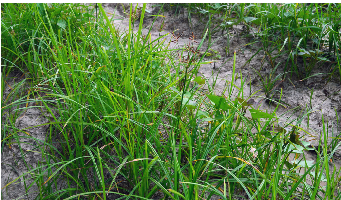
Figure 1. Yellow nutsedge in sweetpotato plant propagation beds (top). Yellow and purple nutsedge in a sweetpotato production field (bottom).