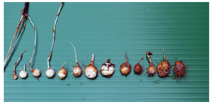
Figure 3. Yellow nutsedge tubers of varying maturity.