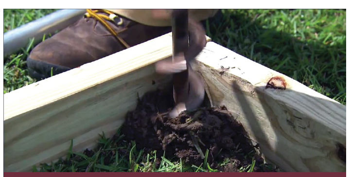
Step 2: Dig or drill holes for the eight pieces of galvanized pipe in each corner and along each long side to a depth of approximately 12 to 18 inches.