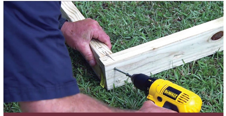
Step 1: Line up the 2x4-inch baseboards—two 10-foot boards and two 12-foot boards. Secure them with 2½-inch deck screws.