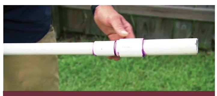
Step 4: Glue a 6-inch section of 1½-inch PVC pipe to each end of a 1-inch-wide, 20-foot-long PVC pipe using the PVC reducing couplings.