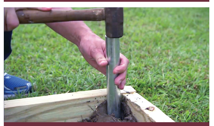
Step 3: Set the galvanized pipe using a hammer, leaving about 6 inches of pipe above the baseboards. At this point, you could use concrete to stabilize each post if you dug holes larger than the diameter of the galvanized pipe.