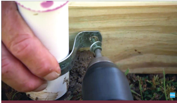
Step 8: Secure the PVC bows to the base using pipe straps and 1\frac{1}{2} -inch deck screws.