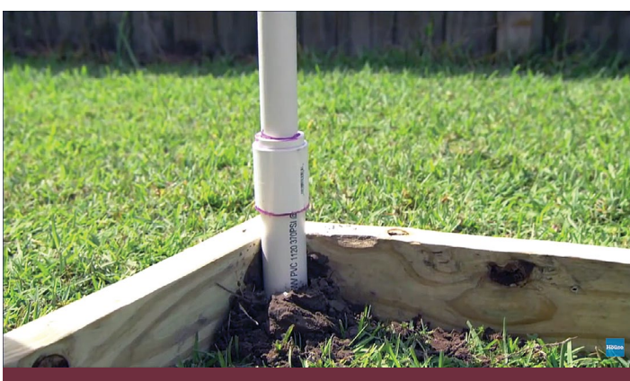
Step 6: Check to ensure the PVC pipe is straight.