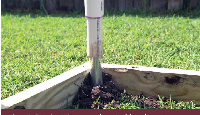
Step 5: Slide the PVC pipe onto the ends of the galvanized pipe.