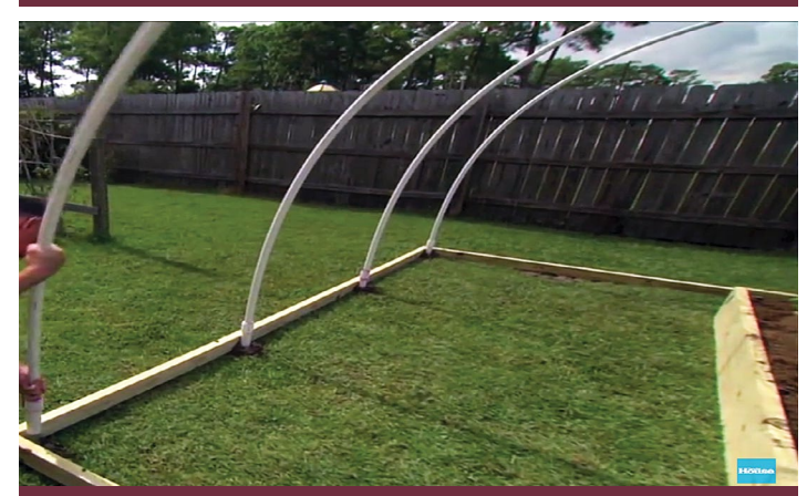
Step 7: Repeat the process to make and install the other three 20-foot bows on the remaining galvanized pipes.