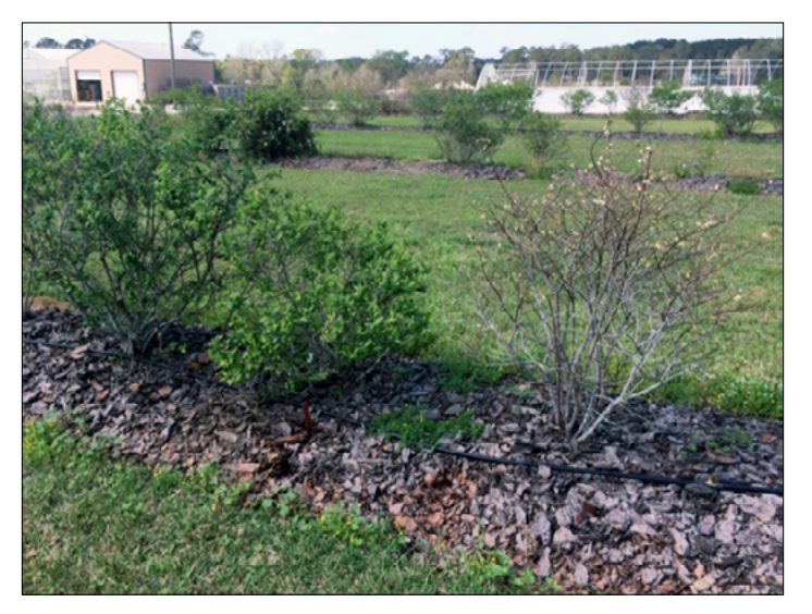
Figure 1. From left to right: Springhigh, Jewel, and O'Neal southern highbush blueberries. Notice that O'Neal has no leaves, but Springhigh and Jewel do. This is likely because O'Neal did not get the required chilling hours for leaf buds to emerge. Photo taken in Poplarville, Mississippi, in 2016.

Typically, temperatures between 32°F and 50°F can help fulfill the chilling requirement of many plants, but the most efficient temperatures for satisfying a plant's need for cold are between 32°F and 45°F. When temperatures dip below 32°F, very little, if any, chilling is received by the plant. Conversely, when temperatures exceed 60–70°F for extended periods, chilling can be negated.