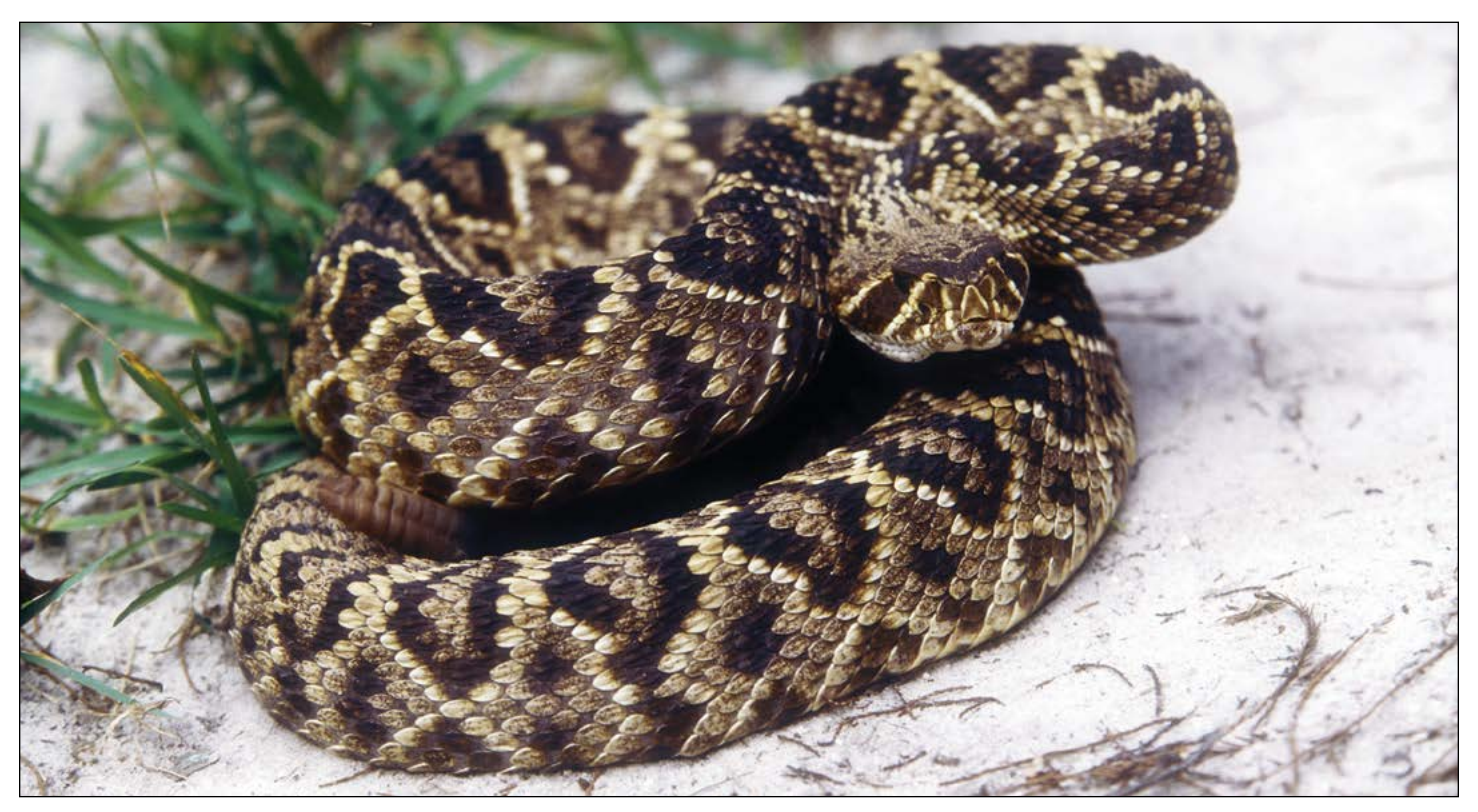
Eastern Diamondback Rattlesnake

Snakes are important members of the natural world. All make a significant contribution to the control of pests such as mice, rats, and insects that can cause property damage or spread diseases. Kingsnakes—so named because they feed on other snakes, including venomous ones—are particularly beneficial to people.