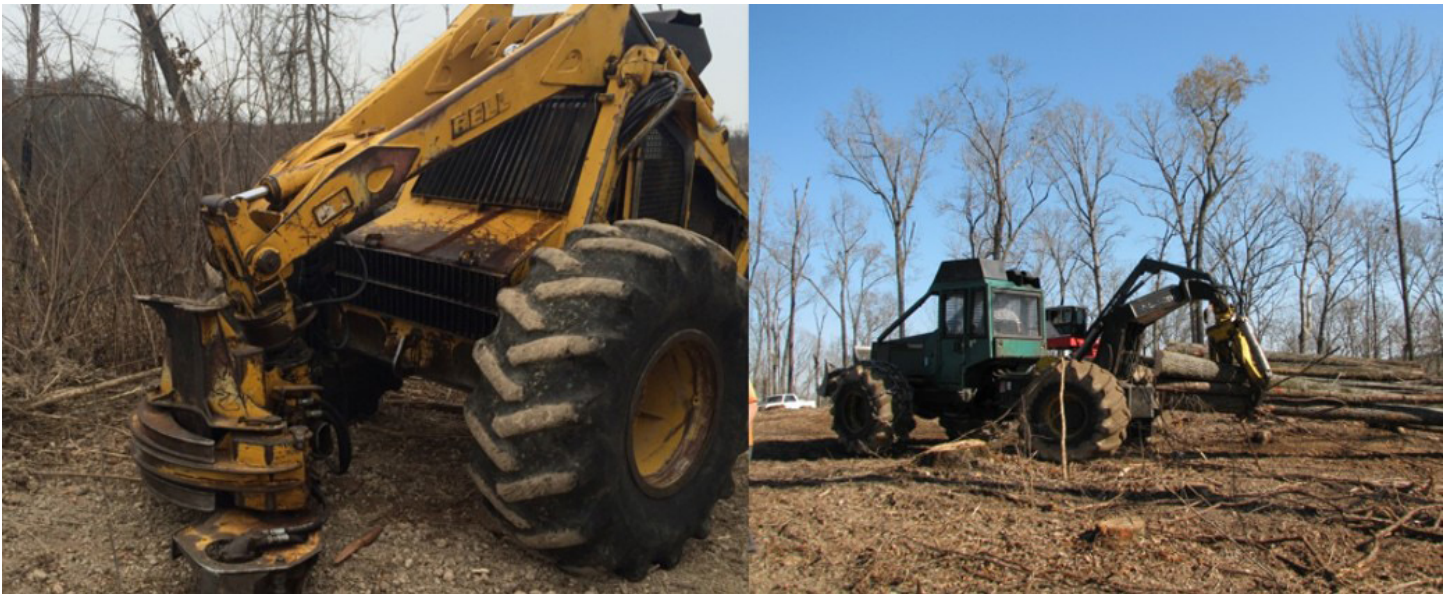
Figure 14. Use smaller equipment in hardwood plantation thinnings. Large equipment operators have difficulty working inside hardwood plantation confines without damaging residual stems.

Use logging companies with hardwood and wet site thinning experience if possible. Skid trails and loading decks should be placed in a manner that minimizes overall damage to residual trees and the site. If large saplings are near residual trees, leave them to protect against damage from equipment and skidded trees. If possible, do not use large equipment when thinning hardwood plantations. Use smaller cutters and skidders with narrower tires to minimize bole damage to residual stems (Figure 14).