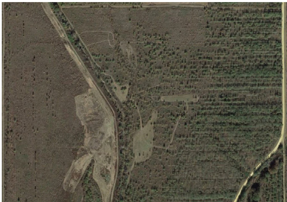
Figure 2. A hardwood plantation where species/site relationships were not considered. Notice the spaces between planted trees that indicate high levels of tree mortality. Scattered tree distribution across the stand limits self-pruning and lowers overall wood quality, often to a point where continued silvicultural management of the stand should be questioned.

As noted previously, hardwood plantations are planted using much lower seedling densities than would be encountered in natural regeneration. Limited funds necessitate low numbers of planted trees per acre (TPA). Some of the more common recommended planting densities have been 12-by-12 feet (302TPA), 12-by-10 feet (363TPA), and 10-by-10 feet (435TPA). Without additional natural seeding from adjacent stands, these densities are not adequate to create the early competition and mortality observed in young naturally regenerated forests, which typically contain thousands of seedlings (Figure 3). Consequently, lower bole quality results as these trees mature without undergoing early natural pruning. These stems have larger, low-quality cores compared to those grown in naturally regenerated stands. This problem is intensified in scenarios where higher levels of early mortality (often encountered in these stands) exacerbate problems with low-quality wood production. When planted tree survival falls to 70 percent or lower, living branches do not die, and self-pruning may be delayed for several additional decades (Figures 4 and 5).