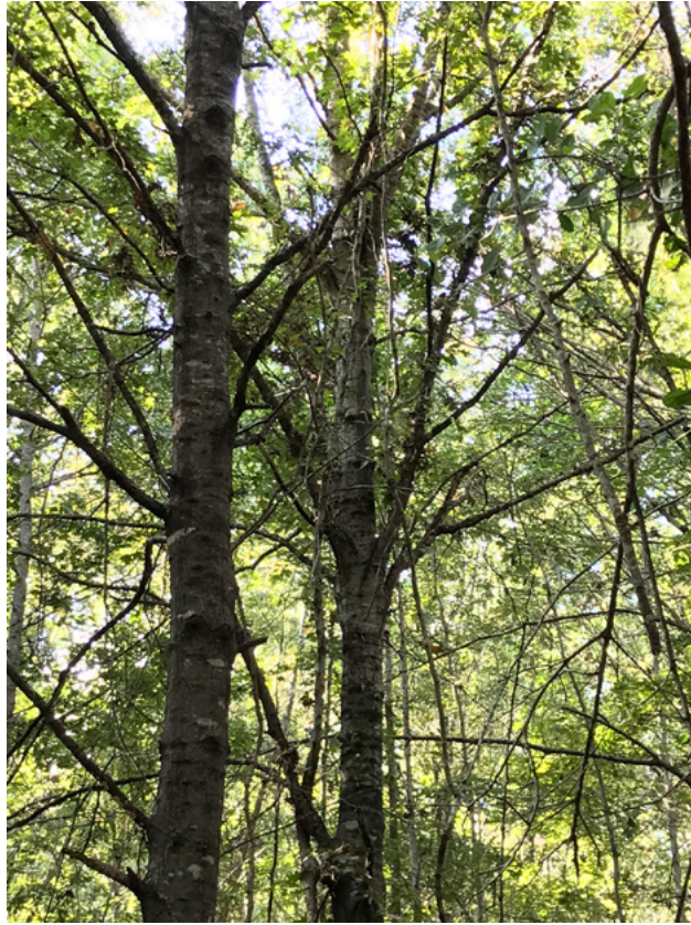
Figure 5. Persistent lower limbs on Nuttall oak trunks in a 23-year-old plantation. Limbs of this size and vigor will not self-prune until log quality, severely reducing commercial value.