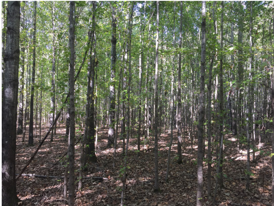
Figure 6. A 20-year-old water oak plantation that received numerous wind-blown sweetgum seed after planting. Planted tree bole quality and growth are usually improved through natural encroachment by light-seeded species. Note that early in the life of this stand, sweetgum seedlings would likely have numbered in the tens of thousands, but natural mortality is decreasing their numbers.