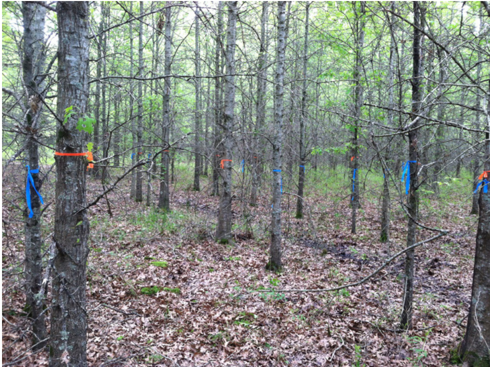
Figure 9. A 19-year-old direct seeded Nuttall oak stand. Note the difference in size among blue and orange flagged trees despite their age similarity. Blue flags mark trees that would be removed in a thinning operation when they reach a commercial harvest size.