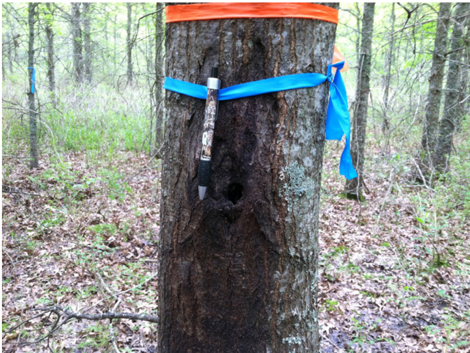
Figure 10. Internal wood quality is compromised as a result of this bole defect. This tree should be removed in a thinning operation.