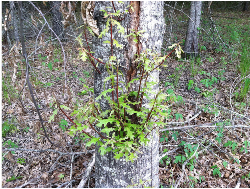
Figure 11. Epicormic branches on a 19-year-old Nuttall oak trunk resulting from bole exposure to increased sunlight after a thinning operation.

epicormic branching ranging from relatively low (e.g., cherrybark oak) to very high (e.g., water and willow oak) levels.