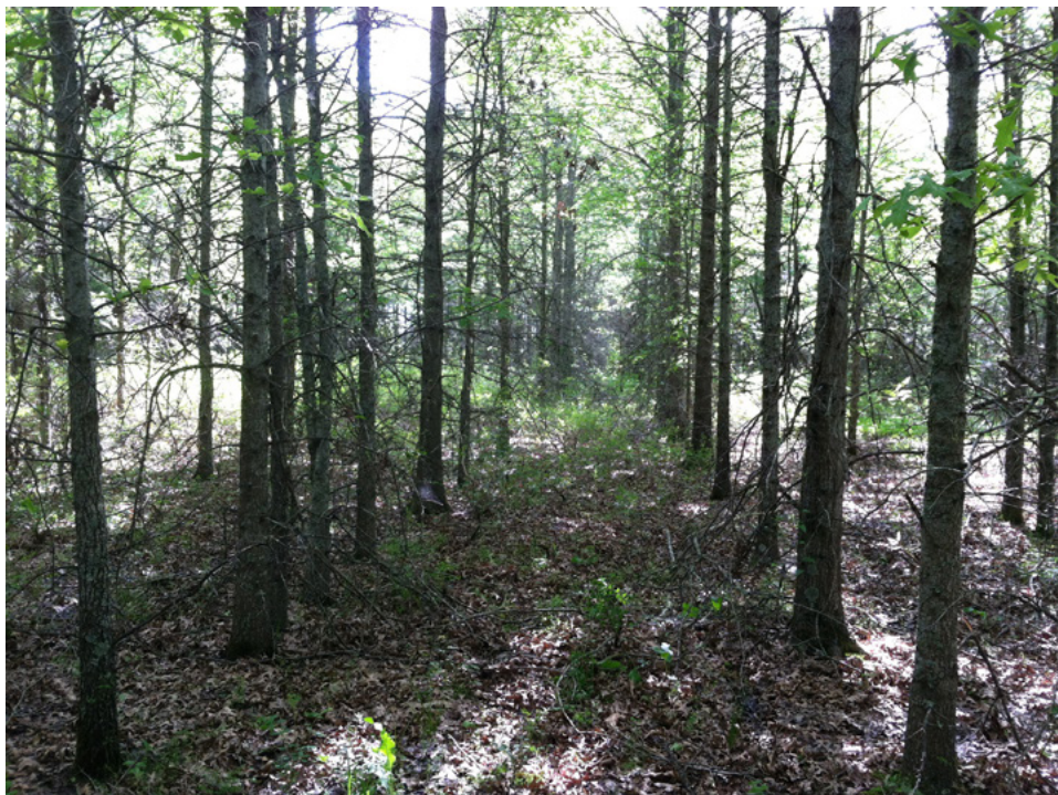
Figure 1. This 21-year-old Nuttall oak stand is not ready for thinning. Notice the prevalence of low living limbs and small-diameter stems.

Site productivity and condition are also major influences to consider regarding thinning expectations for hardwood