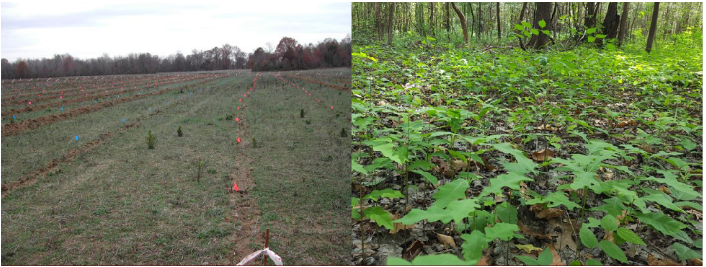
Figure 3. Pin flag-marked Nuttall and Shumard oak seedlings planted using a 10-foot spacing (435 TPA) (left) compared to young, naturally regenerated Nuttall oak germinants (thousands per acre) (right).