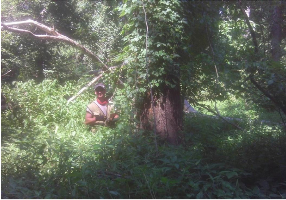
Figure 8. Collecting good inventory data is necessary to assess thinning appropriateness in hardwood plantations.

few stems of desirable species, harvesting the entire stand may be the best option.