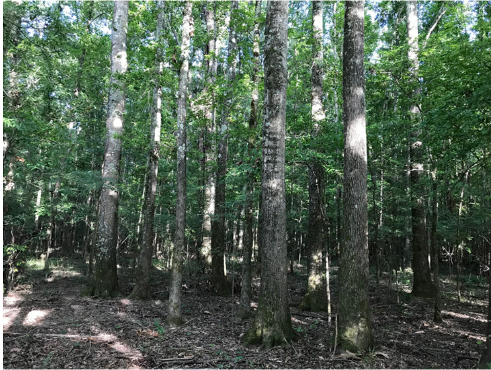
Figure 7. A mature naturally regenerated water oak/sweetgum stand. Notice the straight, limb-free water oak trunks. The positive influence of interspecific competition improved the wood quality of these stems.