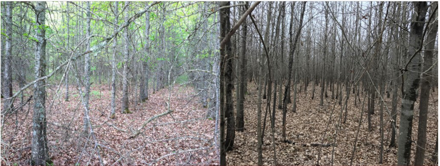
Figure 4. A 19-year-old Nuttall oak plantation (left) compared to a 15-year-old naturally regenerated Nuttall oak stand (right). Note the prevalence of low living limbs on the plantation trees versus the relatively limbless (and smaller) tree trunks in the naturally regenerated stand. Internal wood defects from limbs are concentrated into a smaller core in the natural stand.

Species composition is typically another differing characteristic between natural and plantation stands. Natural stands usually have multiple species growing together simultaneously, while plantations are often planted using only one or two species. Traditionally, the intent in hardwood plantation silviculture is that adjacent stands serve as seed sources for enrichment through wind-dispersed seeding by light-seeded woody species (e.g., sweetgum, red maple, green ash; Figure