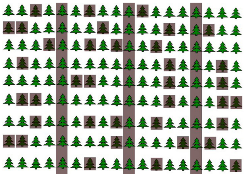
Figure 13. A fifth-row thin design with residual row selections. Removing selected trees from the residual “leave” rows reduces stand density to target levels while maintaining the quality of residual trees.