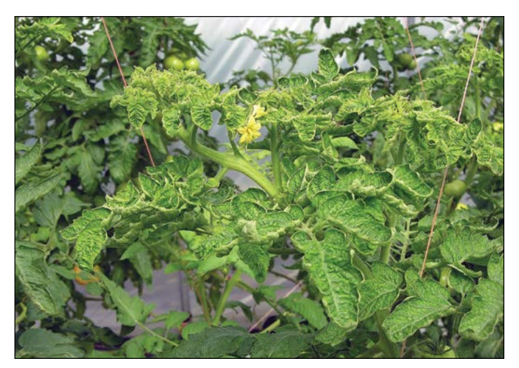
Figure 5. Tomato plants infected with tomato yellow leaf curl virus commonly exhibit an upward curling (cupping) of leaves.