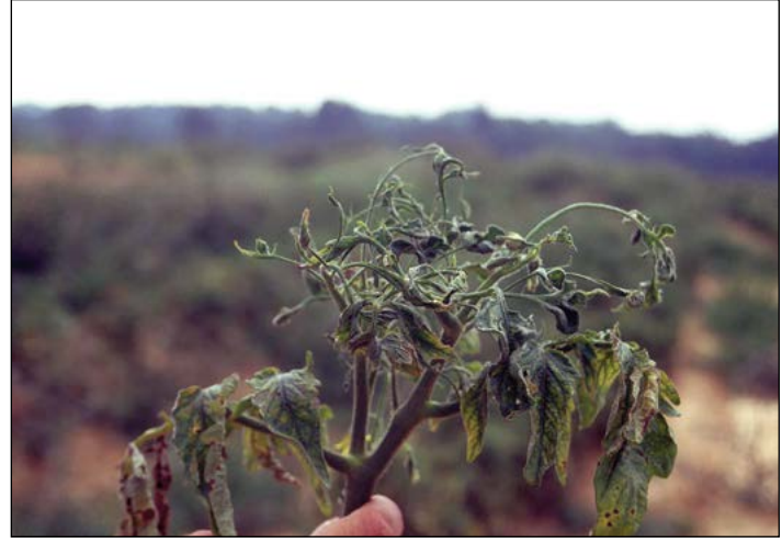
Figure 4. Tomato plants infected with cucumber mosaic virus commonly exhibit leaf and stem distortion. These symptoms also commonly occur when tomatoes are exposed to 2,4-dichlorophenoyxacetic acid (2,4-D).