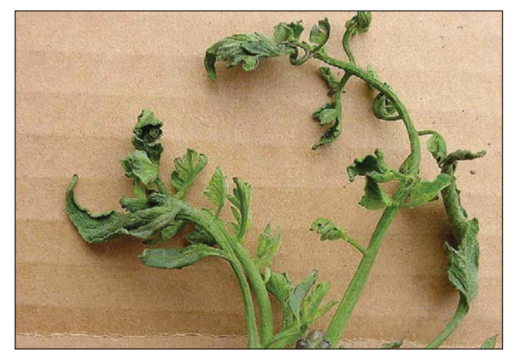
Figure 3. Leaf and stem distortion, as seen in this tomato plant, are common symptoms of exposure to growth regulator herbicides such as 2,4-D.

2,4-D damage may be confused with plant diseases caused by certain viruses that cause curling and distortion of leaves, such as cucumber mosaic virus (CMV) and tomato yellow leaf curl virus (TYLCV) ( Figures 4 and 5 ). Many of these viruses are transmitted by insect vectors, such as aphids (vector of CMV) and whiteflies (vector of TYLCV). If susceptible varieties are being grown and viruses are the cause of the observed symptoms, the insect vectors will likely be present and easily observed in the planting.