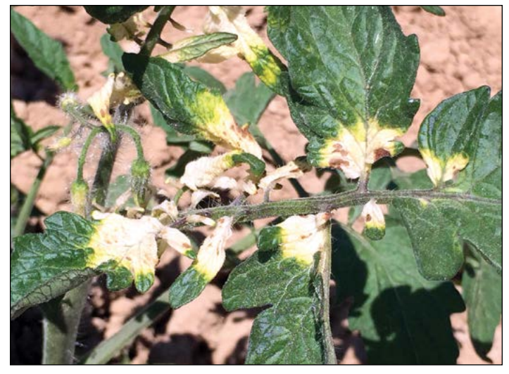
Figure 2. Tissue at the base of leaflets in actively growing terminals becomes chlorotic and eventually necrotic in tomato plants exposed to herbicides, such as glyphosate, that interfere with plant cell metabolism.

Exposure to glyphosate often occurs as a result of drift or sprayer contamination. However, tomatoes may also be exposed by coming into contact with residual glyphosate in the soil or on plastic mulch. The RoundUp® label suggests ½ inch of rainfall or overhead irrigation to remove residues from plastic mulch before transplanting. Residual activity, depending on the source, may be observed from 2 days to several weeks after application.