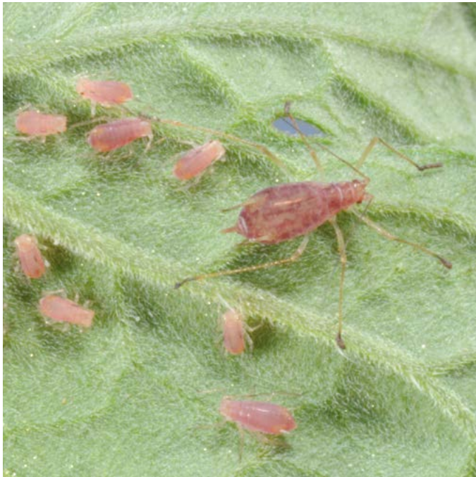
Figure 1. Potato aphids are one of several species of aphids that can occur on greenhouse tomatoes. Color can vary from red to green.