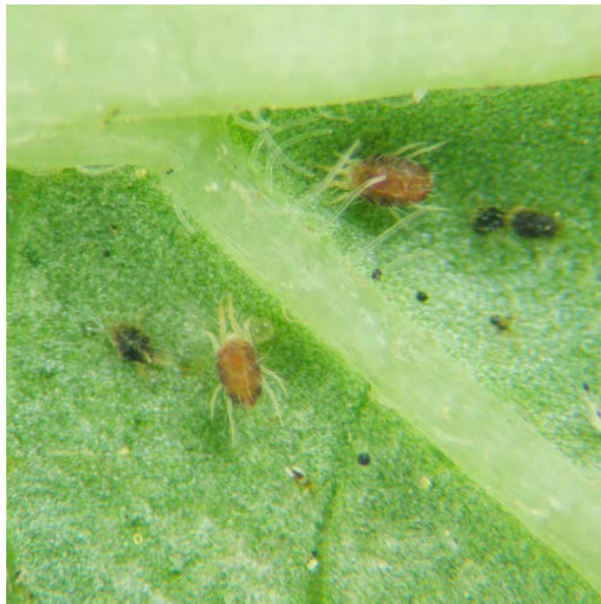
Figure 7. Spider mites feed on the undersides of tomato leaves.

The best way to control fungus gnats is to use media drenches to control the larvae. Treatments containing azadirachtin or Bt israelensis can be used as media drenches. Foliar sprays of short-residual insecticides, such as pyrethrins, can provide short-term reductions of adult numbers, but they will not control larvae and will not be effective as stand-alone treatments.