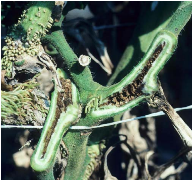
Figures 26. A brown, degraded pith and laddering may be observed in tomato stems with pith necrosis.

Tomato pith necrosis ( Pseudomonas spp.) is sometimes referred to as bacterial hollow stem. Affected plants sometimes wilt and show a slight yellowing of lower foliage. Pathogen spread occurs via contaminated pruning and harvesting equipment.