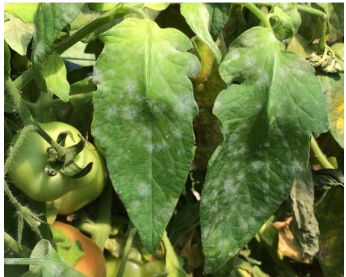
Figure 20. The white fungal growth on the upper surface of these tomato leaflets is a sign of powdery mildew.

Powdery mildew ( Leveillula taurica and Oidium neolycopersici ) can be found throughout North America, but it has not been a widespread greenhouse tomato problem in Mississippi. The pathogen L. taurica is restricted to areas with semi-arid or arid environments; however, the pathogen O. neolycopersici favors humid environments and can be problematic in greenhouses.