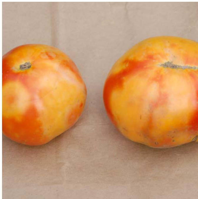
Figure 5. Tomato spotted wilt virus causes circular splotches on fruit.

Thrips reproduce on a large number of crops and weeds, many of which serve as hosts of TSWV. The eggs, which are inserted into plant tissue, hatch into elongate, spindle-shaped larvae. They begin feeding on the undersides of