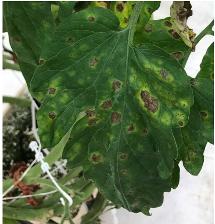
Figure 21. Target spot lesions on tomato leaflets have a target-like appearance and are typically surrounded by chlorotic tissue.

Early symptoms of target spot first appear on foliage as small, water-soaked lesions on the upper surface of older leaves. These lesions rapidly grow to form light- to dark-brown circular lesions that take on the appearance of a target (Figure 21). Chlorotic halos develop around individual brown lesions on leaflets. Lesions may also appear on stems and fruits. Symptoms on fruit begin as sunken, pinpoint-sized, brown lesions. These lesions enlarge and develop into crater-like spots that continue to grow and will crack open as fruit ripens. This disease may move quickly from foliage to fruit, causing a large reduction in the yield of marketable fruit.