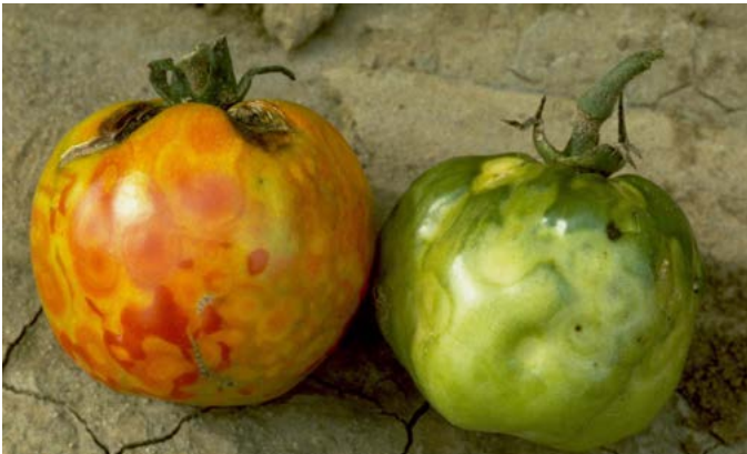
Figure 28. Symptoms of tomato spotted wilt on tomato fruits.

Immuno-strip test kits are available to check for the presence of TSWV in tomatoes. These kits are inexpensive, dependable, and easy to use. Contact your county Extension office to find out where test kits can be purchased. Samples of plants can also be submitted to a disease diagnostic laboratory for testing. Plants suspected to be infected with TSWV should be removed.