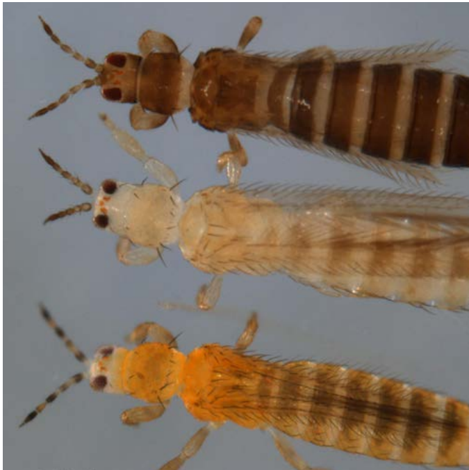
Figure 4. Thrips are small, only about one-sixteenth of an inch long, but western flower thrips (bottom specimen) vector tomato spotted wilt virus.

This pest is susceptible to contact sprays of pyrethrins, but make two applications at 7-day intervals. Spinosad is not specifically labeled for psyllids, but it is labeled for tomatoes and has given high levels of control of tomato psyllids in some trials.