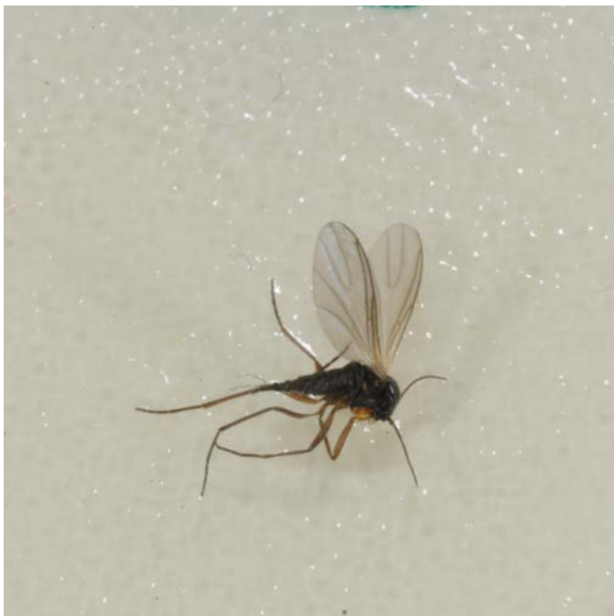
Figure 6. Adult fungus gnats are tiny, mosquito-like flies. The larvae cause damage by living in the growing media and feeding on root hairs.