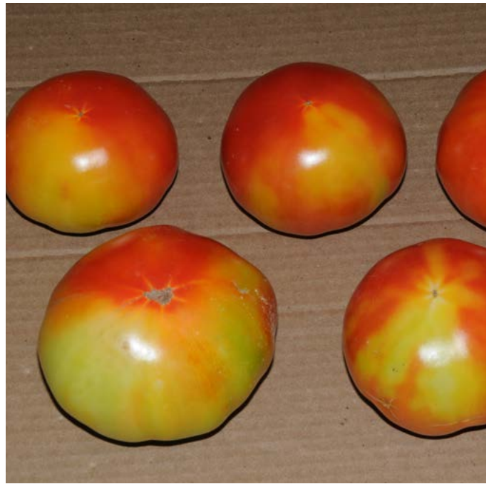
Figure 3. Irregular ripening is a physiological response to feeding by silverleaf whiteflies that causes wedge-shaped, unripened areas that begin at the bloom end and extend toward the stem.

adults. Except for the newly hatched crawlers, immatures are immobile scale-like insects. They look like tiny, oval scales attached to the undersides of leaves. Whiteflies cause damage by sucking sap from plants and producing honeydew, which supports the growth of sooty mold. These insects can build up to very high levels in protected greenhouse environments and are capable of causing severe crop loss.