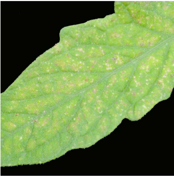
Figure 8. Stippling on the upper surface of leaves is usually an indication of spider mite infestation.

infestation are leaves that look stippled. Close examination of the undersides of leaves with a hand lens will reveal all stages of mites and eggs. When infestations are heavy, a fine webbing of silk will often be present, and mites may be found on the upper surface of the leaves.