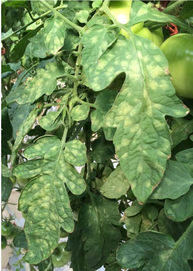
Figure 18. Yellow leaf mold lesions are visible on the upper surface of these tomato leaflets.

Leaf mold ( Passalora fulva , formerly Fulvia fulva and Cladosporium fulvum ) was a common and severe problem in the early 1970s because resistant varieties were not available. Today, varieties that have resistance to various races of the leaf mold fungus are available. Infection by the leaf mold fungus occurs when relative humidity remains at 90 percent or higher for several hours.