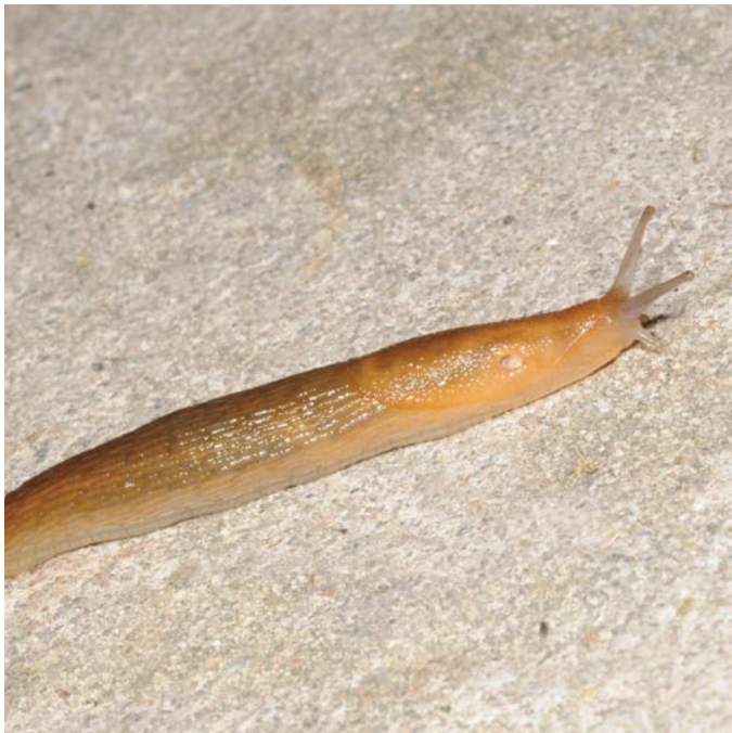
Figure 12. Slugs occasionally occur in greenhouses.

Specific caterpillar treatments, such as spinosad, provide good control when applied in a timely and appropriate manner. Chlorfenapyr will control leaf-feeding caterpillars but is less effective against tomato fruitworms. Foliar-applied Bt sprays are most compatible with biological control programs, but because they are slow-acting, these must be applied when caterpillars are small.