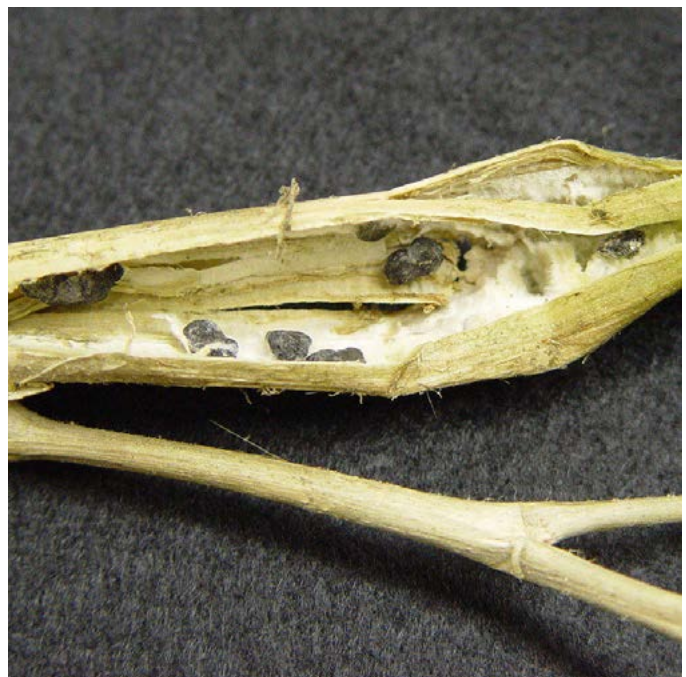
Figure 22. White mycelial growth and black sclerotia are often present inside a timber rot stem lesion on a tomato.

Key sign: White fungal growth on the plant stem and black sclerotia (resembling rat droppings) on or inside the plant stem at the site of the lesion (Figure 22).