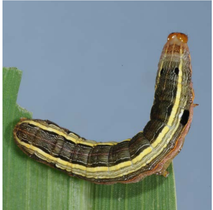
Figure 11. Yellow-striped armyworms sometimes damage leaves and fruit in inadequately screened greenhouses and high tunnels.

are mainly foliage feeders, but they will occasionally damage fruit. Because armyworms lay their eggs in large masses, heavy infestations may occur in isolated areas within the greenhouse, and timely spot treatments can often provide effective control.