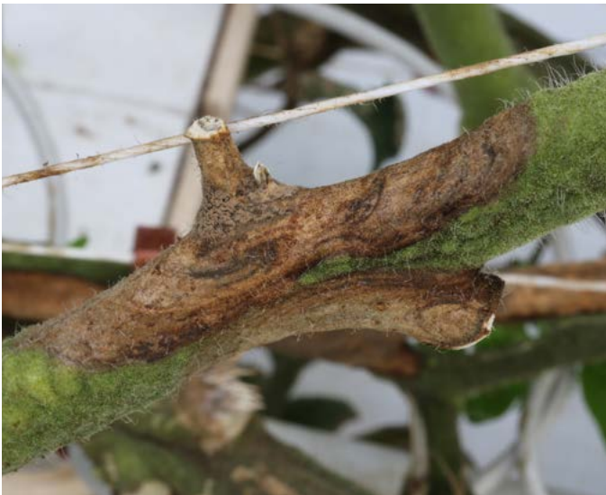
Figure 14. Gray fungal growth is present near the center of the Botrytis stem lesion around a pruning wound on this tomato stem.

An unusual symptom associated with this disease is the production of “ghost spots,” small whitish rings or halos that develop on the fruit (Figure 15). These “ghost spots” are spots where Botrytis spores germinated but failed to infect the fruit.