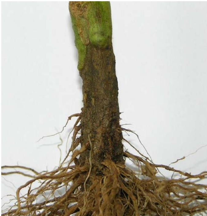
Figure 23. A brown lesion at the base of the tomato stem may be present in plants with bacterial wilt.

Key sign/symptom: Vascular discoloration and bacterial streaming in plants that exhibited rapid and permanent wilting followed by plant death.