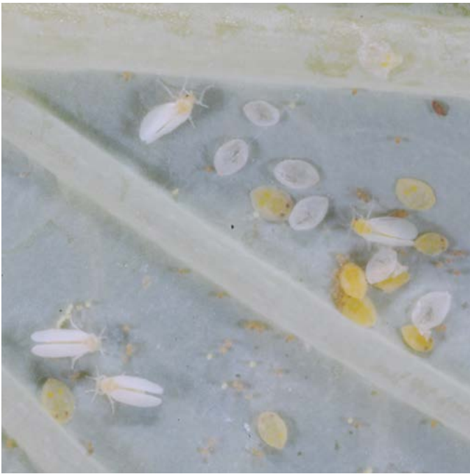
Figure 2. Silverleaf whiteflies are the most damaging insect pests of greenhouse tomatoes. Adults are only about one twenty-fifth of an inch long.