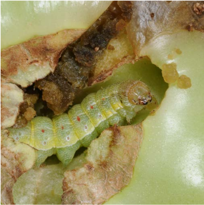
Figure 10. Tomato fruitworms are important pests of field-grown tomatoes. Their presence in the greenhouse indicates that exclusion practices could be improved.