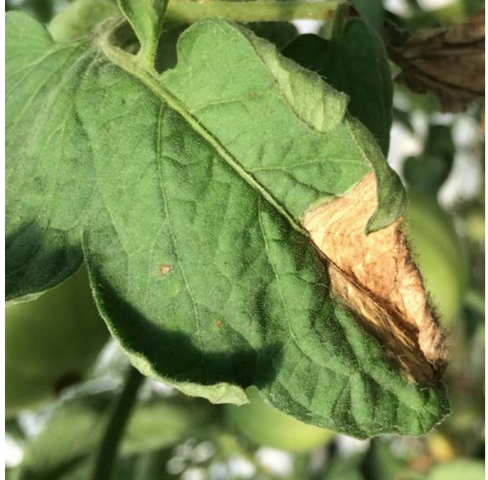
Figure 13. Gray fungal growth is visible in the area of the Botrytis lesion on the edge of this tomato leaflet.

Key sign: Brown or gray, fuzzy fungal growth present on infected tissues.