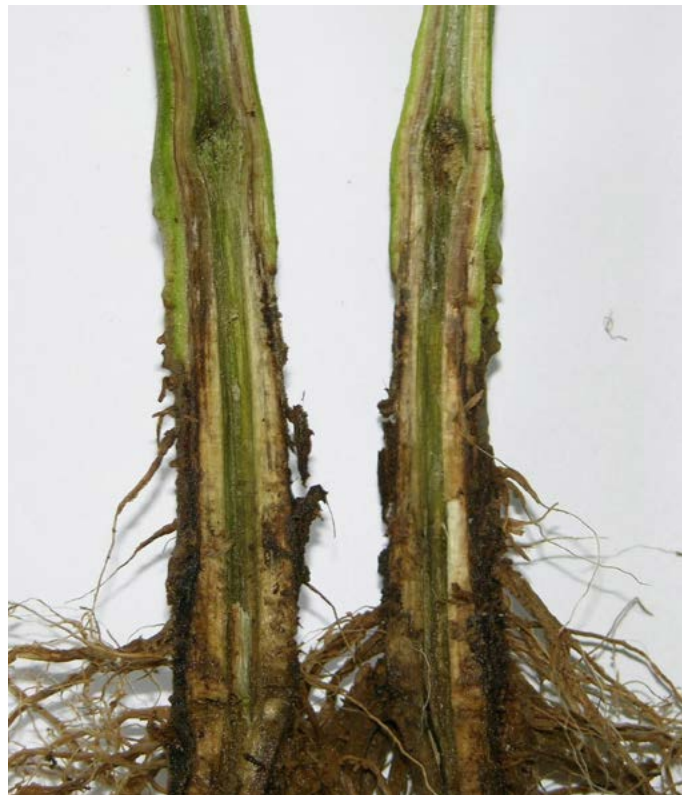
Figure 24. Vascular discoloration may occur in plants with bacterial wilt.

Plants infected with the bacterial wilt pathogen rapidly wilt and die without showing symptoms of chlorosis (yellowing) or leaf necrosis (death). A brown lesion may be visible on the outside of the stem near the base of the plant (Figure 23). When cut near the base of the stem at the soil/media line, the inside of the stem may be dark and water-soaked (Figure 24). In plants with advanced infections, the stem may be hollow.