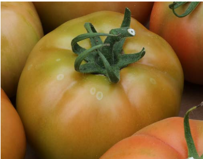
Figure 15. The ghost spots on this ripening tomato fruit are an unusual symptom of Botrytis gray mold.

An unusual symptom associated with this disease is the production of “ghost spots,” small whitish rings or halos that develop on the fruit (Figure 15). These “ghost spots” are spots where Botrytis spores germinated but failed to infect the fruit.