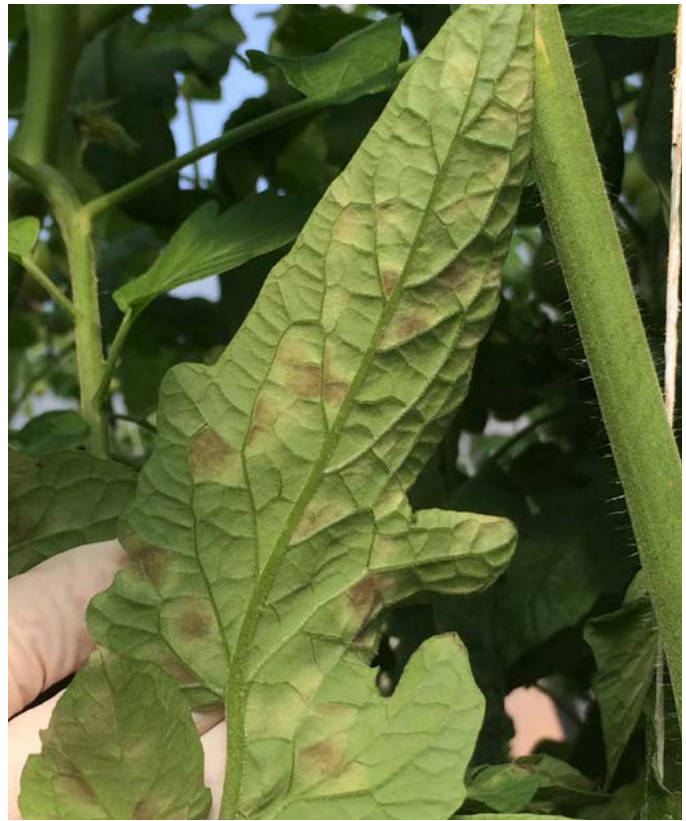
Figure 19. Olive-green Passalora fulva (leaf mold) fungal growth is visible on the lower surface of this tomato leaflet.

Leaf mold is a foliar disease. Symptoms begin on lower, older leaves but progress to younger leaves over time. Infected leaves become yellow-brown and drop prematurely. Defoliation progresses up the plant.