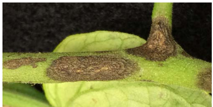
Figure 17. Concentric rings are visible in the early blight lesions on this tomato stem.

Fusarium crown and root rot (FCRR, Fusarium oxysporum f. sp. radices-lycopersici ) was first found in Mississippi greenhouse tomatoes in the late 1980s. This disease is favored by cooler temperatures and can spread quickly in a greenhouse.