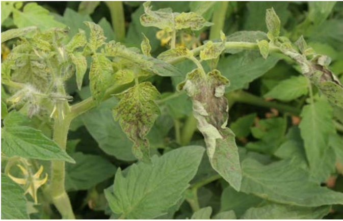
Figure 27. Leaves of tomato plants with tomato spotted wilt may have a bronze coloration.