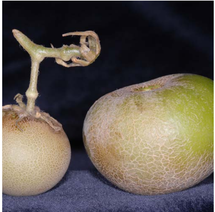
Figure 9. Tomato russet mites are microscopic in size, but symptoms of infested fruit are easy to recognize.

Specific miticides, such as acequinocyl, bifentate, chlorfenapyr, etoxazol, or fenproximate usually give best control.