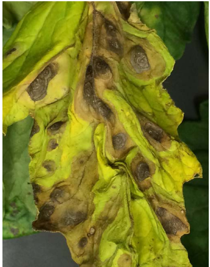
Figure 16. Concentric rings are visible in the early blight lesions on this tomato leaflet. The leaf tissue surrounding the lesions is chlorotic.

Symptoms of early blight may occur on leaves, stems, and fruit (Figures 16 and 17). Circular, brown lesions, up to 2 inches in diameter, develop on infected plant tissues. Concentric rings are often visible in each lesion. The leaf tissue surrounding the brown lesions may be chlorotic (yellow).