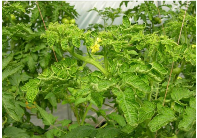
Figure 29. Symptoms of tomato yellow leaf curl in a tomato plant.

may appear crinkled. The symptoms will be subtle at first, but yellowing will increase over time and become very noticeable.