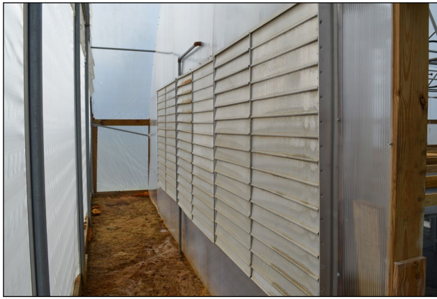
Figure 11. Intake ventilation louvers open to allow air movement through the greenhouse for temperature control.

the most common measure is to add evaporative cooling, also referred to as wet pads or cooling pads. The principle is simple. As the exhaust fans blow air out of one end of the greenhouse, they draw in warm air across the cooling pads. As the warm air moves through the cooling pads, water evaporates and absorbs heat, resulting in cool air moving through the greenhouse.