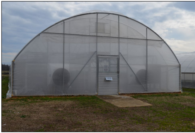
Figure 5. Insect-screened area on the front of a greenhouse; it is also used as a double entry.