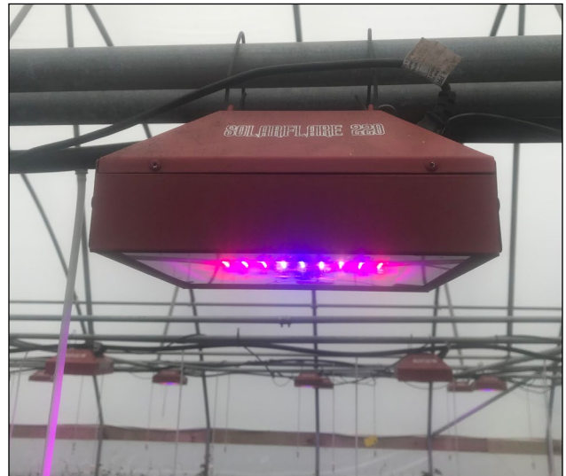
Figure 14. An LED vegetative supplemental growth light.

Light-emitting diode (LED) vegetative supplemental lighting (Figure 14) is used to increase vine growth of sweetpotato slips. It is important to select LED lights that are specifically for vegetative growth (heavier blue-light concentration) and not full-spectrum LED lights. Full-spectrum LED lights will increase flowering, which is not desired for sweetpotato slip production. Do not use lights until after roots are established, about a week after planting. Frequency and duration of use will depend on the time of year slips are being produced and the amount of cloud coverage/sun exposure. Supplemental lighting is used to provide light during extended periods of cloud coverage and/or to extend day length during winter months.