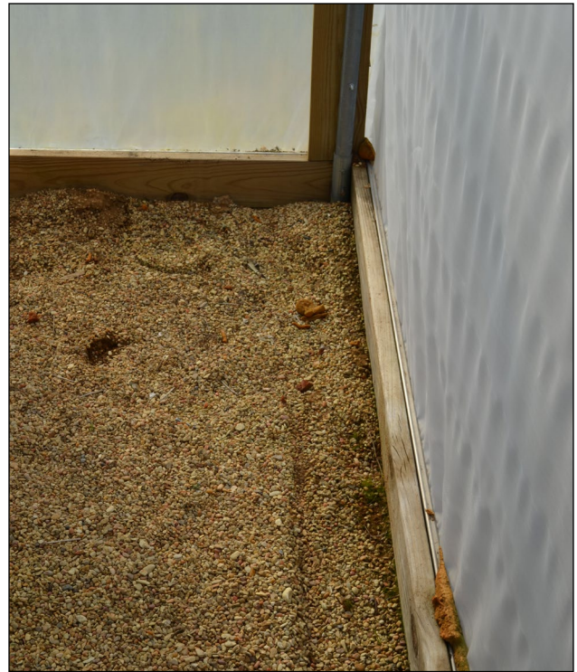
Figure 3. Wooden foundation with pea gravel.

Another foundation option is a concrete slab. Concrete formed with a slight slope to a floor drain is preferred because it is easier to clean and sanitize.