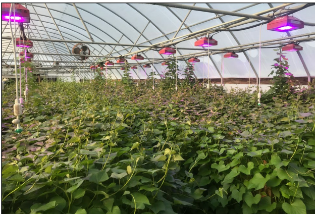
Figure 1. Greenhouse-grown sweetpotato plants.

This publication outlines recommendations for selecting and constructing a greenhouse for virus-tested sweetpotato slip production in Mississippi. Virus-tested sweetpotato slips are the source of clean plant material for production of certified foundation seed roots for the state of Mississippi. Certified seed roots produced from virus-tested, clean plant material provide stakeholders with high-quality, “true-to-type” varieties to maximize commercial yield potential.