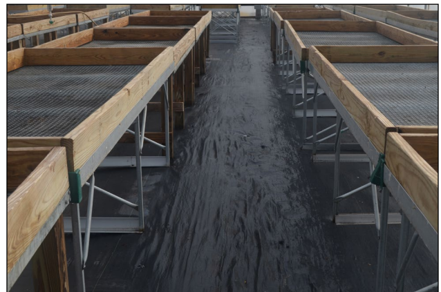
Figure 4. Greenhouse foundation consisting of woven black plastic over pea gravel.