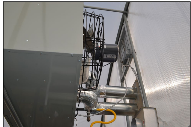
Figure 8. Heater intake (bottom) and exhaust (top) ducts leading from and to the outside of the greenhouse.

If 185,000 BTUs are needed, as in the example above, use 1.85 \times 50 = 92.5 square inches of air intake for the burners.