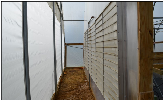
Figure 6. Insect-screened area on the back of a greenhouse.