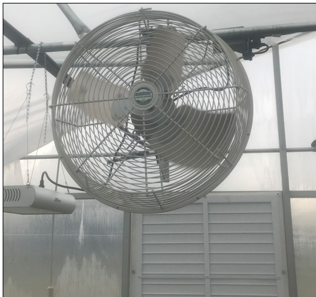
Figure 12. Horizontal fans provide air movement within the greenhouse.

Another technique is to install low-volume horizontal air flow (HAF fans) (Figure 12) above the plants to push air around the greenhouse. These are left on all the time or wired so they turn off when the exhaust fans come on. Horizontal air flow keeps the air moving among the plants at all times.