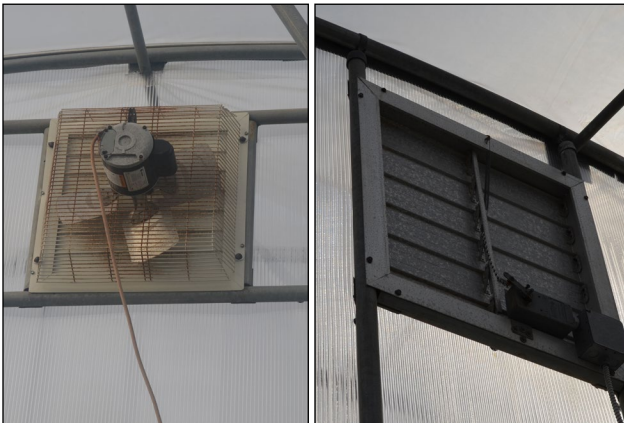
Figure 9. A top ventilation fan and top intake louver provide ventilation for humidity and early temperature control.

Design the ventilation system (Figure 9) so that it moves 8–10 cubic feet per minute (CFM) of air per square foot of greenhouse space. For a 24-by-96-foot greenhouse, two 36-inch or 48-inch fans are usually required. Even with proper ventilation in the warm season, the inside temperature will always be higher than the outside temperature.