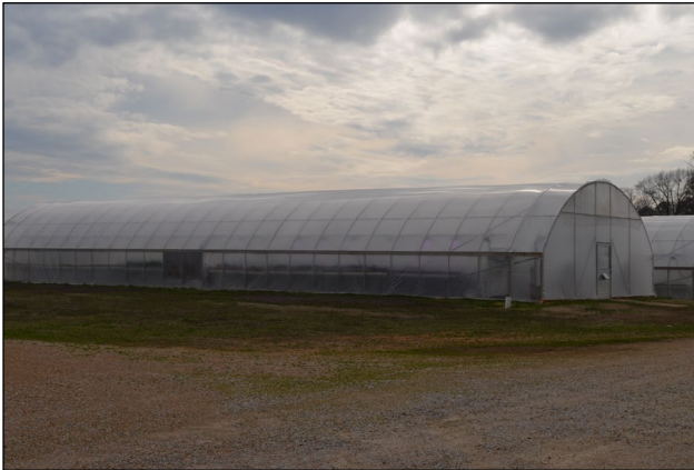
Figure 2. A Quonset-style greenhouse covered with double poly plastic and with a pressure-treated wood foundation.

Quonset-style greenhouse structures (Figure 2) with a double poly plastic covering are common for sweetpotato slip production, but a peak-style structure is also a good choice.