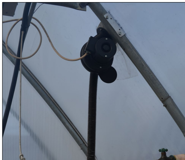
Figure 13. A squirrel-cage blower (fan) is used to inflate between the two layers of plastic covering the greenhouse.

Water collects because the warm, humid air blown between the layers from inside the greenhouse comes in contact with the outside layer of plastic. This outside layer is cooler. If the temperature of the outside layer is below the dew point, as it usually is in the winter, it causes water to condense from the air onto the cool surface. This water collects between the layers into pools that grow with time.