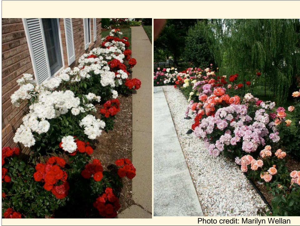
Mixed colors in foundation planting.