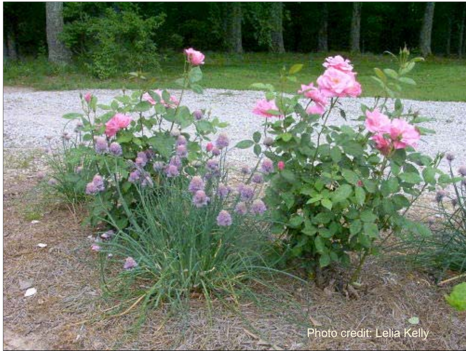
Pink Simplicity with chives.