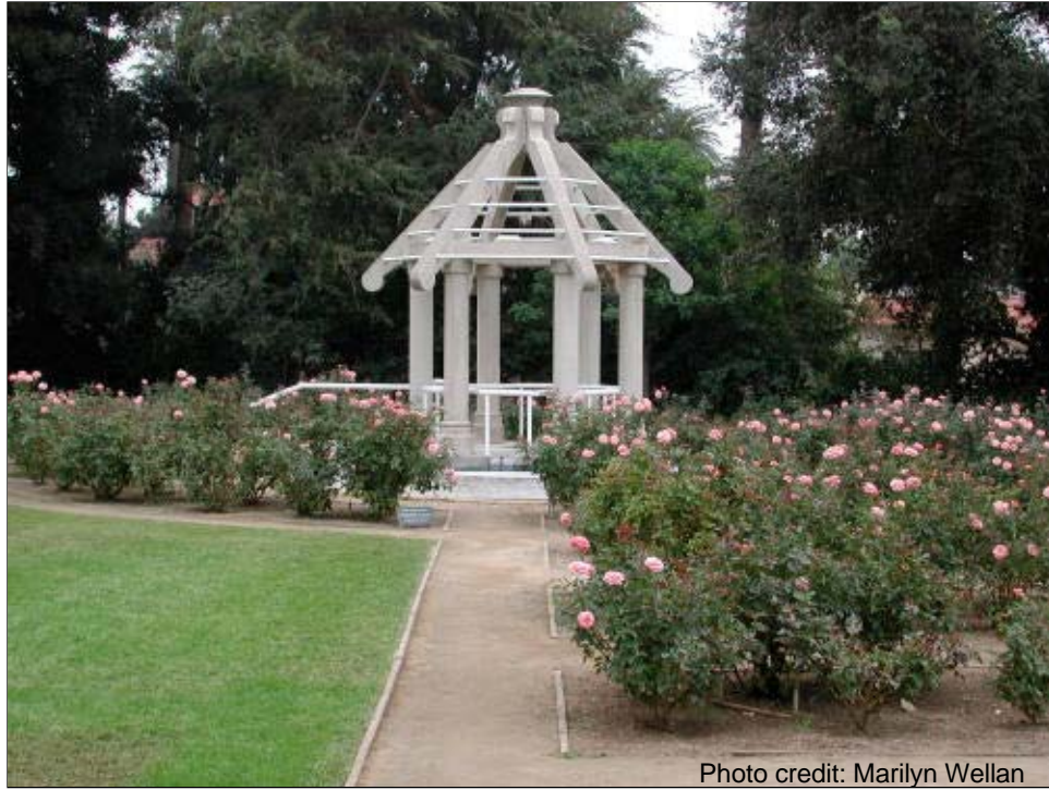
Formal rose garden with gazebo