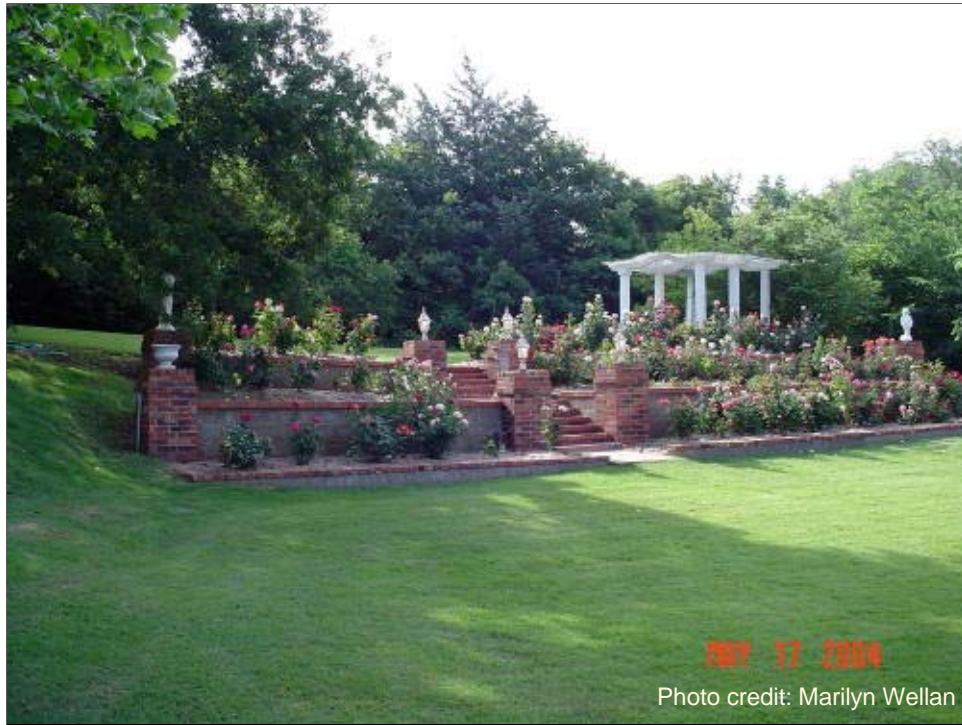
Formal terraced garden.